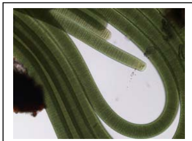
The filamentous cyanobacterium Oscillatoria sp. growing on lake sediments of the Ossiacher See (Carinthia), 200 fold magnification.

Institute for Limnology Mondsee, Austrian Academy of Sciences Mondseestrasse 9 A-5310 Mondsee AUSTRIA