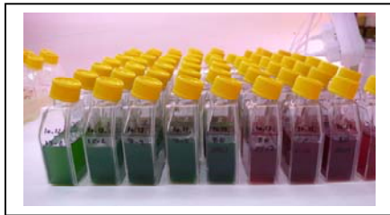
Cultures of cyanobacteria isolated from the Salzkammergut Area and cultivated at the Institute of Limnology in Mondsee

absorbs sunlight in the wavelength from 325-425 nm. It is responsible for the black colour of the so-called “Tintenstriche” on the rocks in the Alps. Cyanobacteria also produce various extracellular polysaccharides that are used for sequestration of nutrients, protection against grazers, and resistance to desiccation. Other cyanobacteria contain various sugar binding proteins, for example cyanovirin-N that is under development as an antiviral agent due to its activity against HIV ( http://aidsinfo.nih.gov/DrugsNew/DrugDetailNT.aspx?int_id=0395prod )