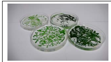
Selection of cyanobacterial clones on nitrocellulose membranes using various selective agents

Ethanol is currently one of the most promising alternative energy sources to gasoline and has up to date been produced via fermentation mainly from corn, sugar cane and other agricultural plants (Marris 2006, see also http://ngm.nationalgeographic.com/ngm/2007-10/biofuels/biofuels.html ). While the photosynthetic assimilation products of cyanobacteria and other photosynthetic microorganisms can be processed into ethanol, the yield of ethanol compared to traditional plant feed stocks is higher because faster growth under optimal conditions can be achieved. In the present project a large number of cyanobacteria will be investigated for photosynthetic capacity and further physiological parameters as well as stress tolerances relevant for large scale processes. Cyanobacteria have been isolated from various habitats both from freshwater and marine systems. Since cyanobacteria show an impressive variation in physiological properties a collection of cyanobacteria from various habitats also provides an excellent platform for the experimental selection of suitable strains.